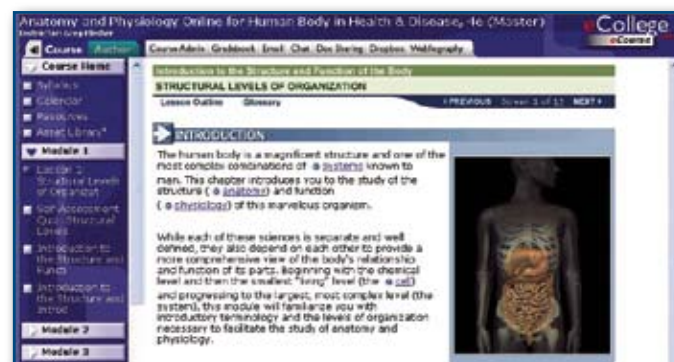
Elsevier's course The Human Body in Health and Disease within the Pearson eCollege platform.

With Evolve Courses on Pearson eCollege, institutions have everything they need to quickly launch online health care courses to expand on key topics and clarify difficult concepts within an existing health professional program.